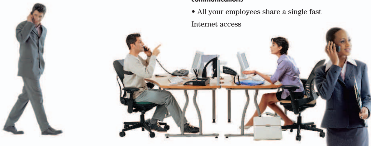
VOICE+INTERNET+DATA All-in-one box